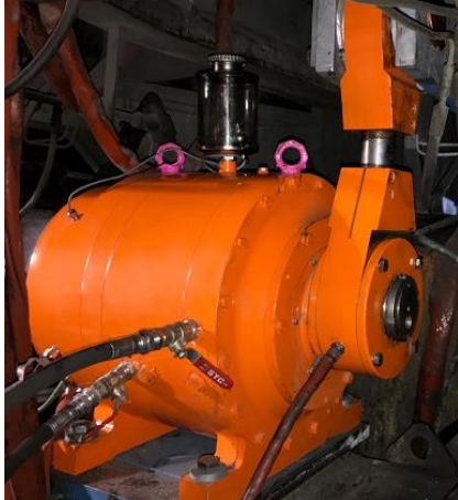
CONDRIVE by SMS Concast AG is developing into a sought-after series product: simple integration and high availability are very well suited to the modernization of continuous casting systems

The basis is formed by the direct drive technology from the KBM motor kits by KOLLMORGEN. A technically demanding joint phase of engineering took place beforehand. The result of this was the development of a drive solution which could create highly flexible oscillation profiles. The current electromechanical drive systems allow the frequency to be regulated online alone, while the amplitude is provided by the mechanical system.