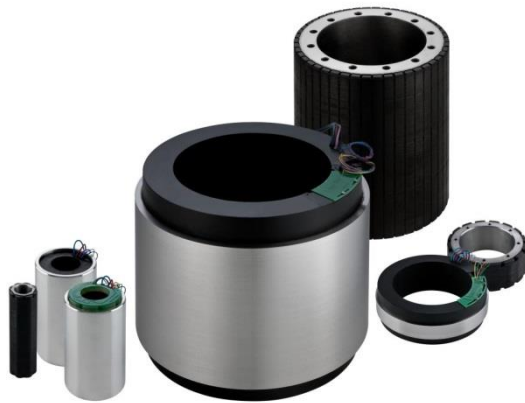
KBM Direct Drive Motor by KOLLMORGEN.

Finally, these three basic conditions have contributed towards KOLLMORGEN equipping the KBM motor with a water cooling system so that the heat loss can be effectively diverted . For the long-term effective lubrication of the few bearings of the gearless direct drives, stators and rotors are completely enclosed in an oil bath – which ultimately also securely protects the encapsulated unit against metal dust.