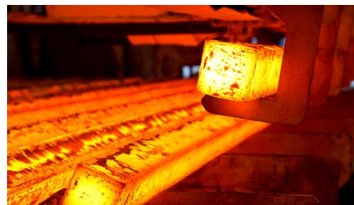
Cut billets on the cooling bed after leaving the continuous casting machine

This overtaking process is known as "negative strip time" and defines the time in which the casting powder is able to lie on outer wall of the steel while being pulled off. The oscillating movement of the casting die requires that the fine waves form on the surface of the strand, known as oscillation marks.